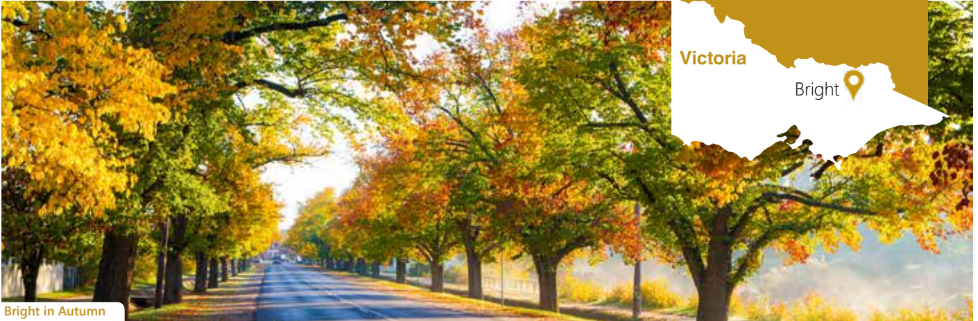
Bright in Autumn