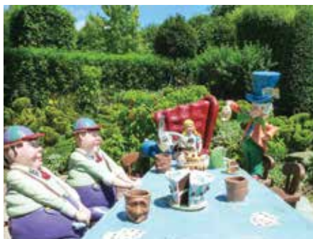
Storybook Garden

A later start today as we spend a leisurely day exploring the Hunter Valley Gardens, Australia's largest garden display spanning 25 hectares. Stroll amongst the displays, take in the superb views from the lookout, sit and ponder at the 10 metre high waterfall at the Sunken Garden or step back in time at Storybook Garden. This afternoon we visit Cessnock and the Hunter Valley Cheese Factory.