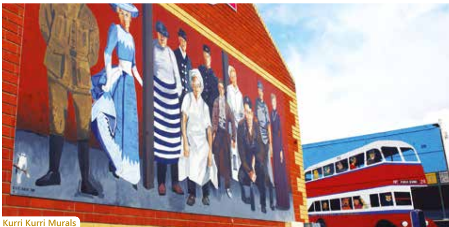
Kurri Kurri Murals