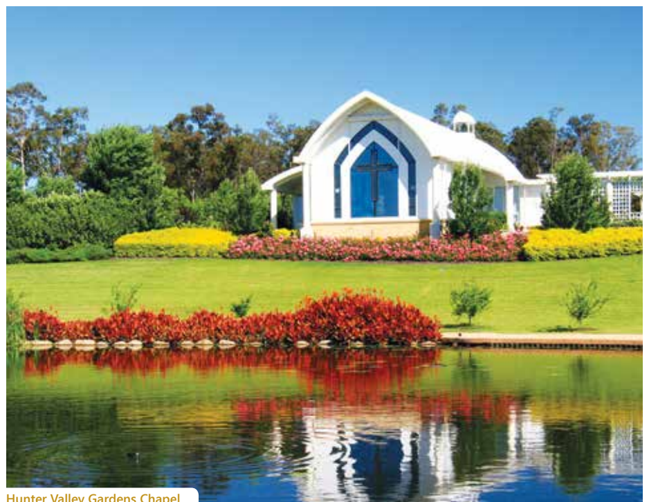
Hunter Valley Gardens Chapel