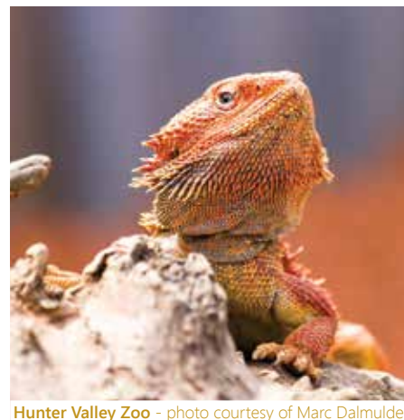
Hunter Valley Zoo