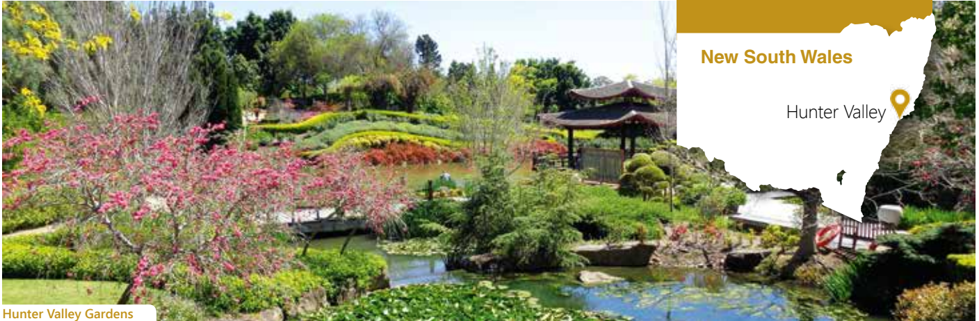
Hunter Valley Gardens