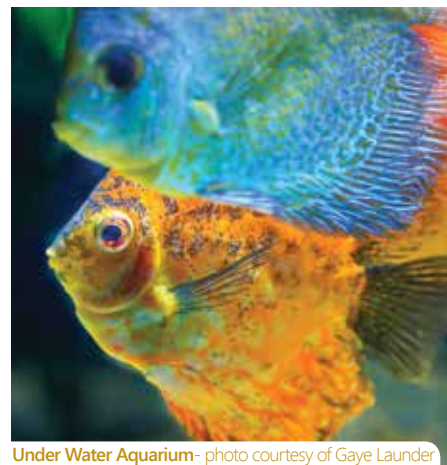
Under Water Aquarium- photo courtesy of Gaye Lauder