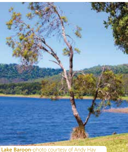
Lake Baroon

A relaxing morning around Noosaville as we stroll along famous Hastings Street and visit Laguna Lookout before catching the Noosa Ferry to Tewantin. Following lunch, we explore the small village of Tewantin Village on the Noosa River before retracing our steps (on the ferry!) back to Noosaville.