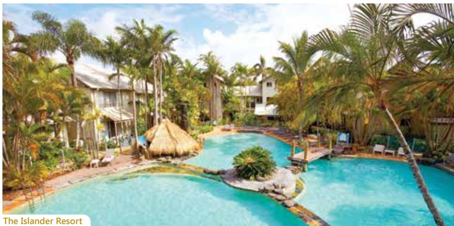
The Islander Resort