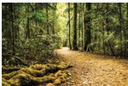
Mary Cairncross Park

As our relaxing holiday draws to a close, we transfer to the Sunshine Coast airport at Maroochydore, to join homebound flights, completing our relaxing holiday in the warm winter sun.