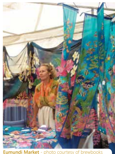
Eumundi Market