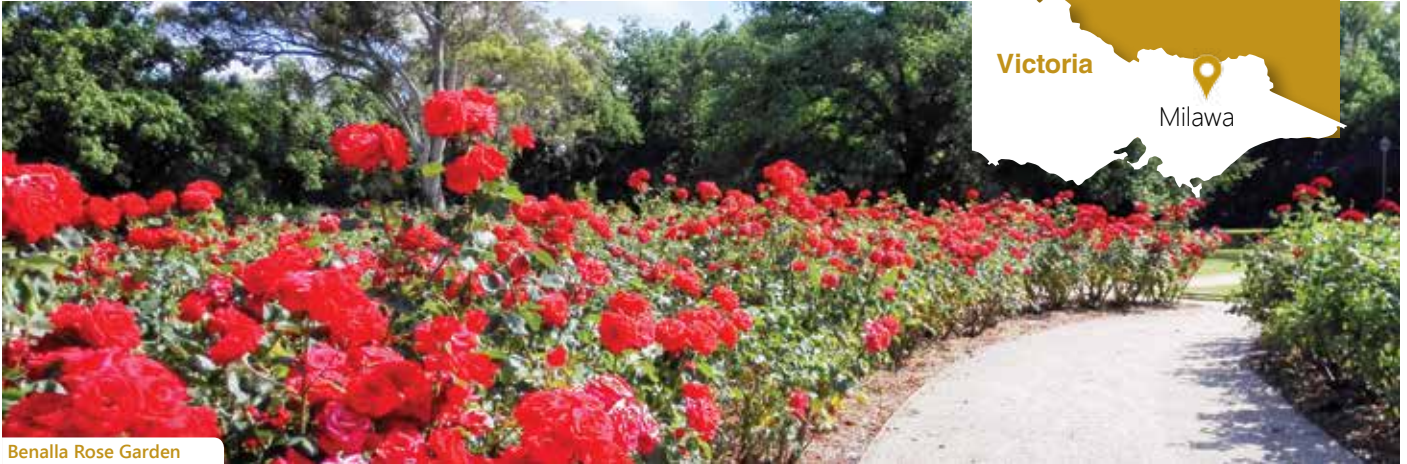
Benalla Rose Garden