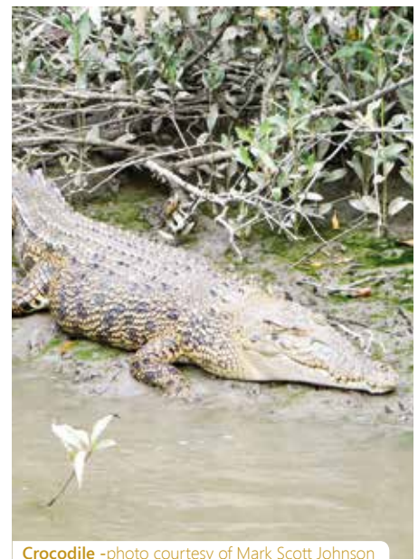
Crocodile