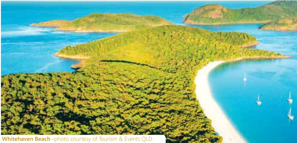
Whitehaven Beach