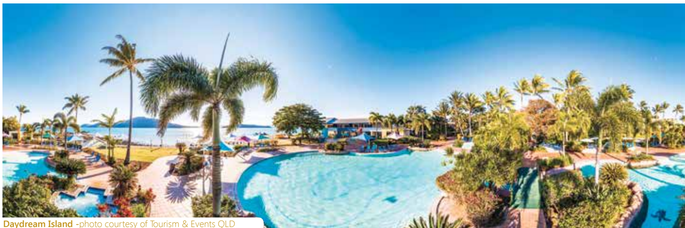
Daydream Island