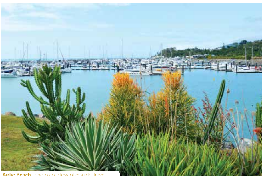
Airlie Beach

Prices from other cities available on application.