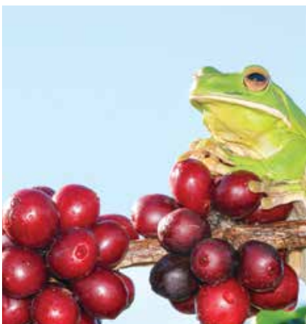
Coffee Plantation

Following a leisurely breakfast we travel to Proserpine and visit the Historical Museum and tour the Whitsunday Gold Coffee Plantation. During the afternoon we explore the township of Airlie Beach, the central hub for the Whitsunday region. Time to stroll along the Main Street, Beach Lagoon or the Bicentennial Boardwalk.